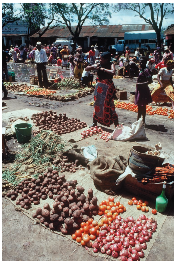
Fruits of labor. Machakos markets are now a source of produce for nearby Nairobi and surrounding areas.